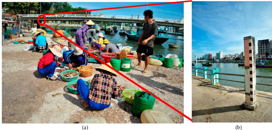
Figure 4. (a) Phu Trinh is located next to the river just above water level (b) Flood marker located at an elevated road at the side of the river, showing historical flooding occurrence in the area (much higher than the level of the ground in the left side photograph).