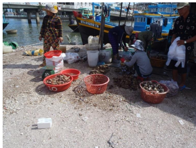
Figure 2. Members of Phu Trinh-Phan Thiet sorting their fish catch.