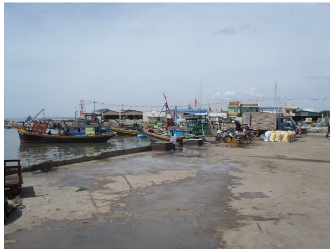
Figure 3. Fishing vessels in the Duc Long port.