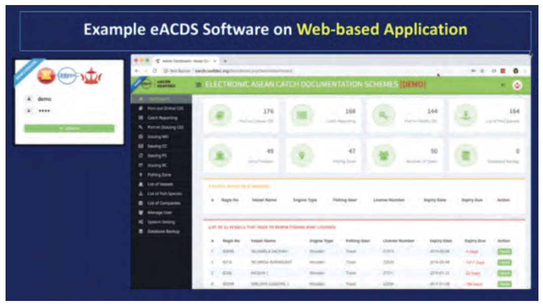
Figure 1. The eACDS software on web-based application

For the development of the software framework of the web-based and mobile application of eACDS, two major phases had been determined. The first phase had been designed for domestic marine capture fisheries, and the second phase is meant for the traceability system of imported fish and fishery products, including products that have been moved through transhipment vessels. The key data elements (KDEs) required for the eACDS include: point of catch, buyers/receivers and sellers (broker/wholesale), processors, exporters and international shipping, importers, and end consumers ( Figure 3 ).