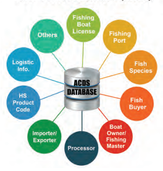
Figure 3. Key data elements required for the eACDS software