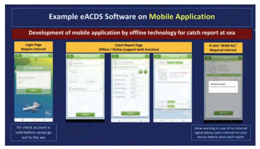
Figure 2. The eACDS software on mobile application