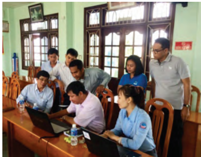
Figure 6. Demonstration of eACDS applications in Viet Nam